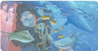
Full immersion in VR and mixed reality spaces