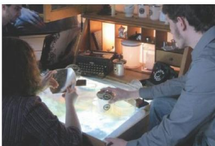
Supported by immersive environmental design

Interactive and Immersive: Engages the guest's head, heart, and hands in building and experiencing their dream product, destination, or service.